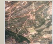
Overview of CBM Field

To extract the methane from the coal seam, a network of production wells, pipelines, and roads is placed across the landscape and large volumes of sometimes marginal quality water must be managed. The goal of this program is to empower landowners and tribal members within the CBM affected states with the training and resources to: