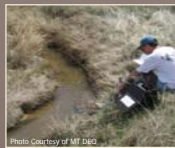
Monitoring Water in Squirrel Creek

This Project is a multi-state project in cooperation with University of Wyoming, Utah State University, and Colorado State University funded by the US Environmental Protection Agency, USDA-CSREES Regional Extension Water Quality Program & Montana Association of Conservation Districts